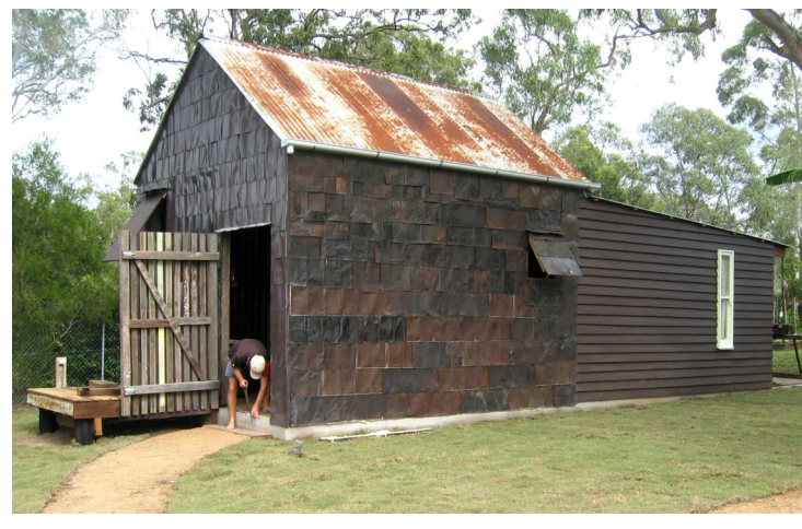
The reconstructed Tin Shack "Laggan House"

Green Camp Road, and its reconstruction in the grounds of the Gumdale and District Progress Association, in New Cleveland Road, just near the traffic lights below Gumdale State School, is told in the Newsletter No.159 March 2024.