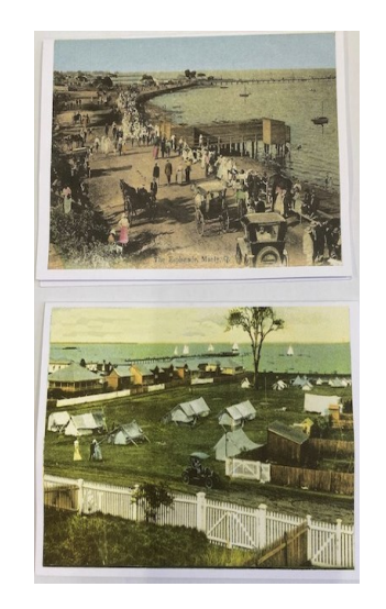
$2 each Bundles of 6 Cards for $10.