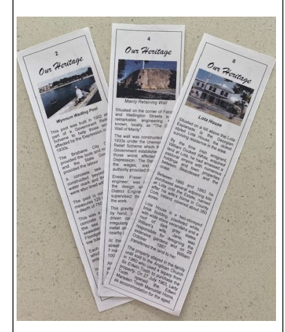
$2 each Bundles of 6 for $10