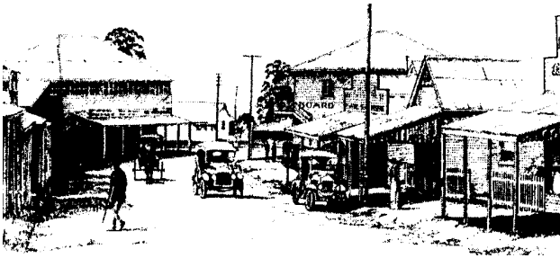
Cambridge Parade Manly Circa 1920